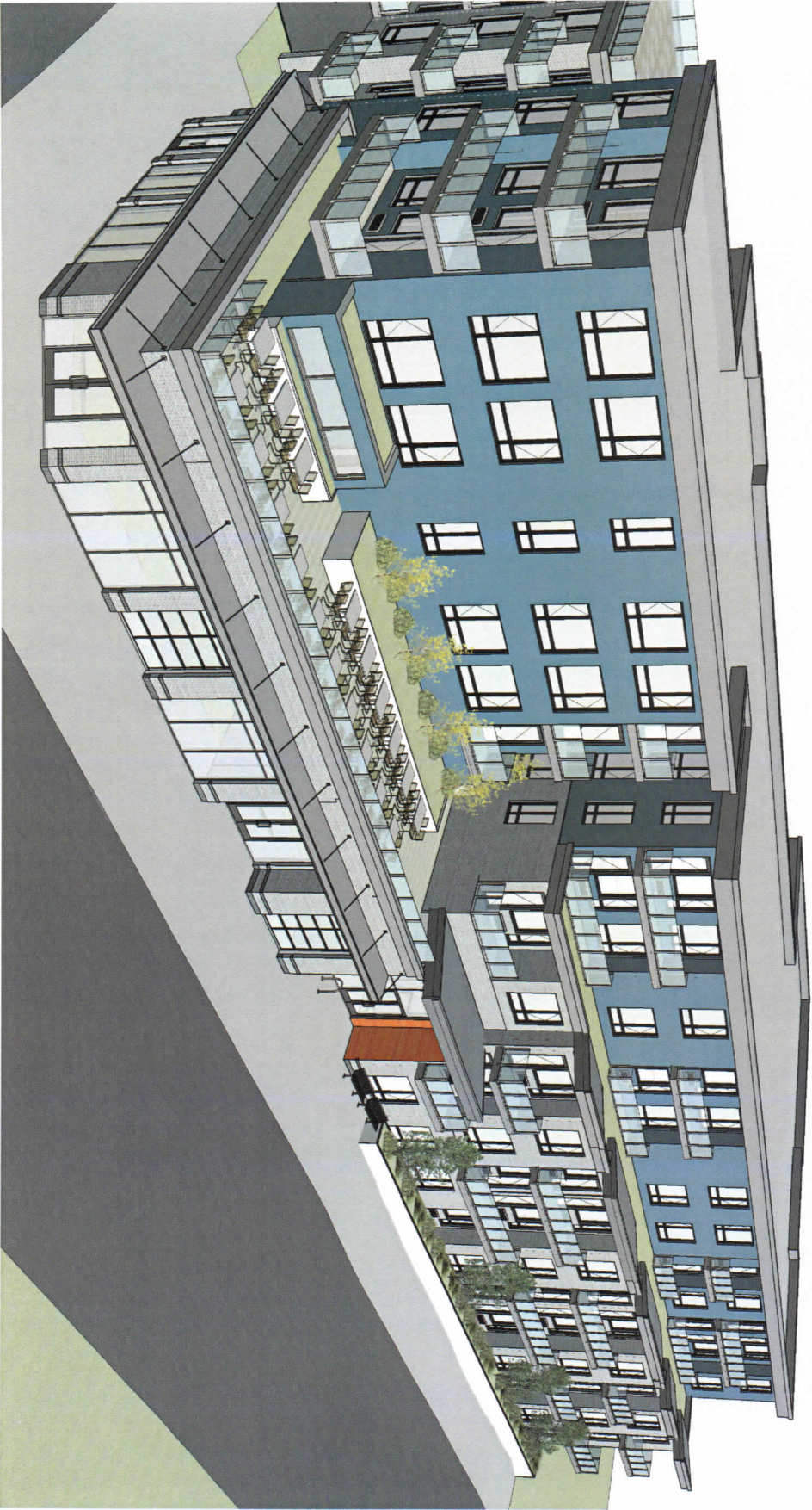
1 NORTHWEST OVERHEAD PERSPECTIVE