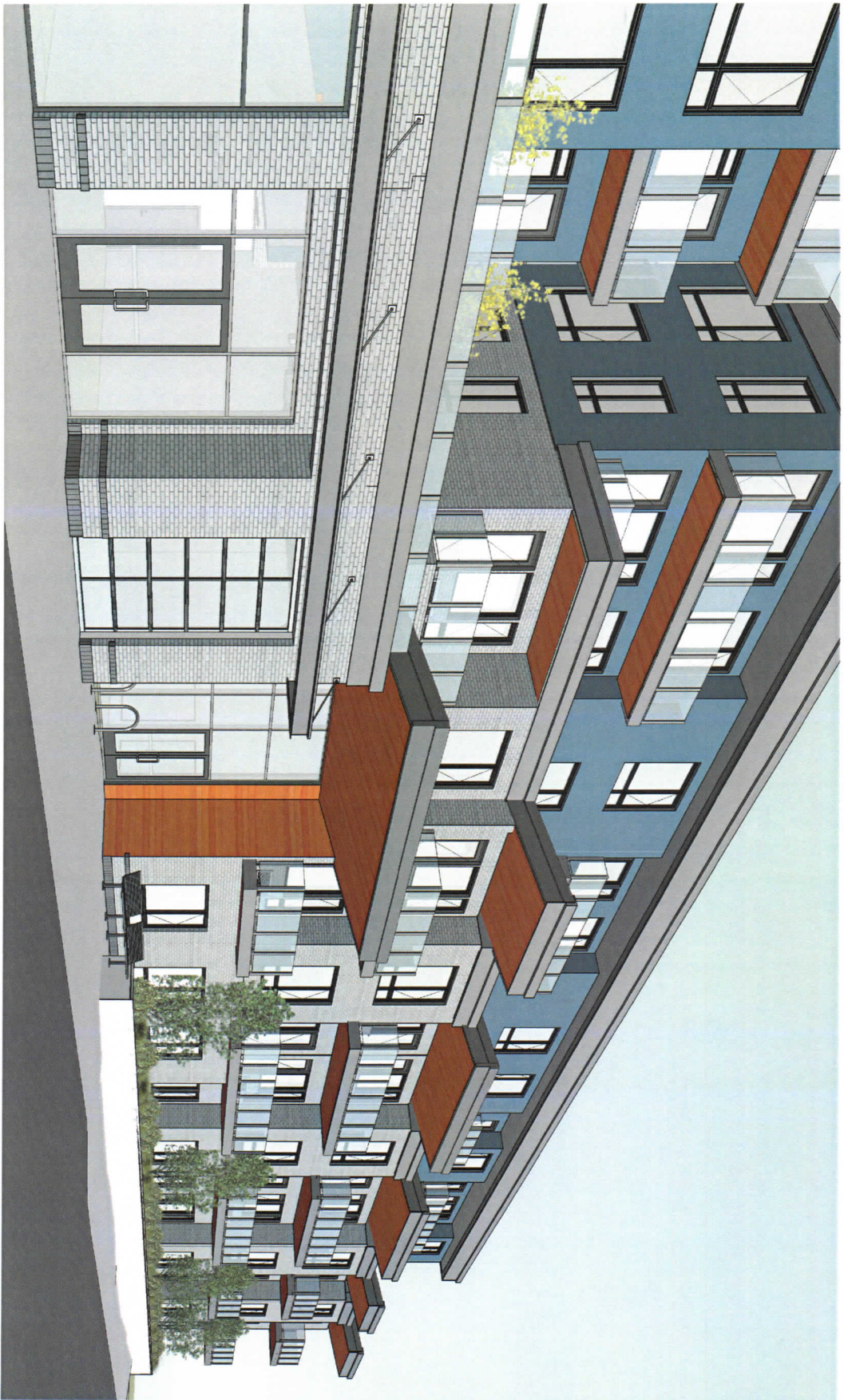
1 VANCOUVER PHASE I ALONG VANCOUVER AVE.