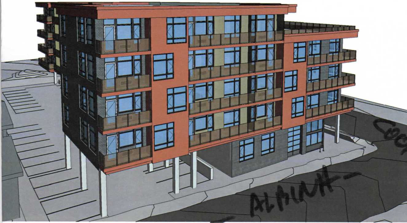
LOW EXTERIOR PERSPECTIVE