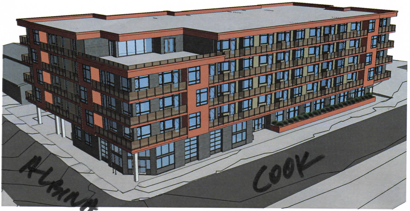
1 SW EXTERIOR PERSPECTIVE